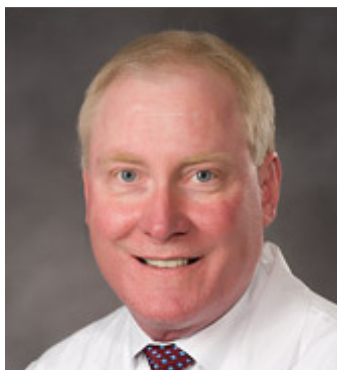
New Chair for Division of Gastroenterology, Hepatology, and Nutrition Page 3