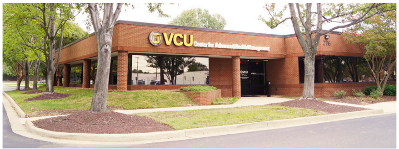
The CAHM outpatient facility is centrally located in Richmond and easily accessible by public transportation.