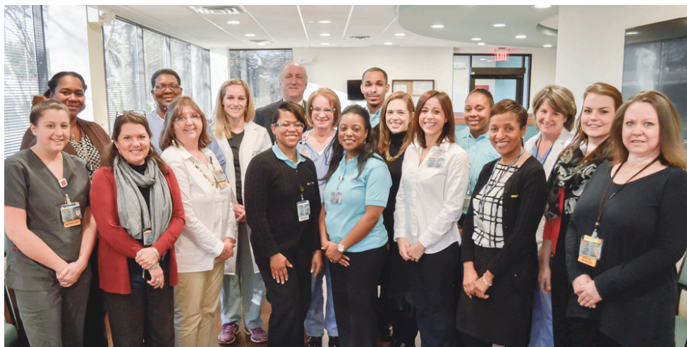
Geriatric Medicine Launches Innovative Center and Model of Care Page 2

I look forward to the many new programs that will be initiated in 2015, to hearing of the achievements of both our new faculty and those of us “seasoned” faculty, to implementation of innovative educational initiatives, and to supporting the academic efforts of our faculty through new mechanisms that the department will be establishing. It will indeed be an exciting time ahead, and I wish you all a healthy, enjoyable and rewarding New Year!