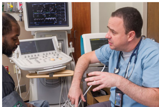
Clinical Researcher Advances Cardiology through Research and Leadership Page 4